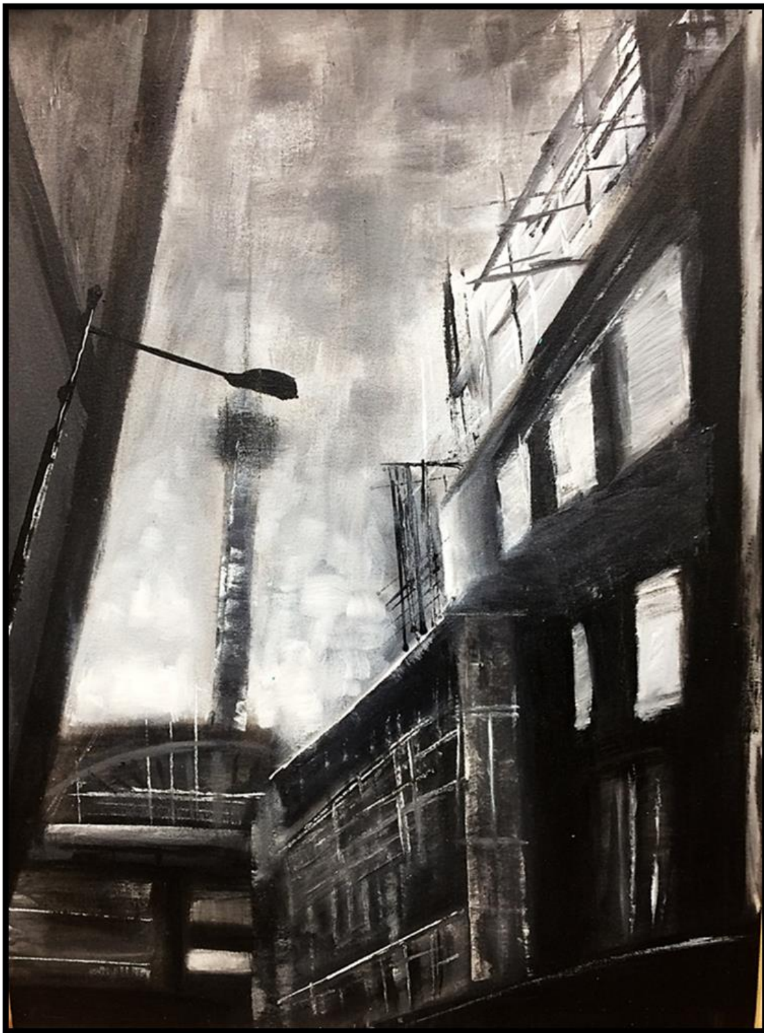
Oil on canvas by Yang (LVI)