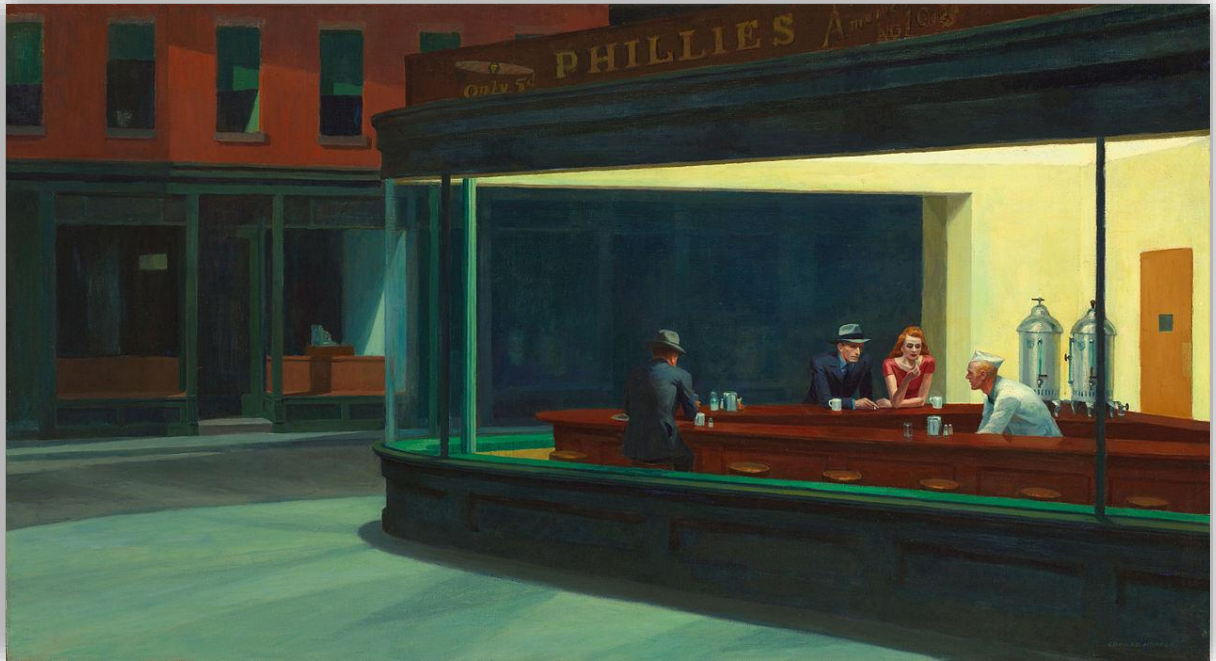
Oil on canvas by Edward Hopper

It was hot, but Charles pulled his jacket on further, as though cowering from the bright light of the diner.