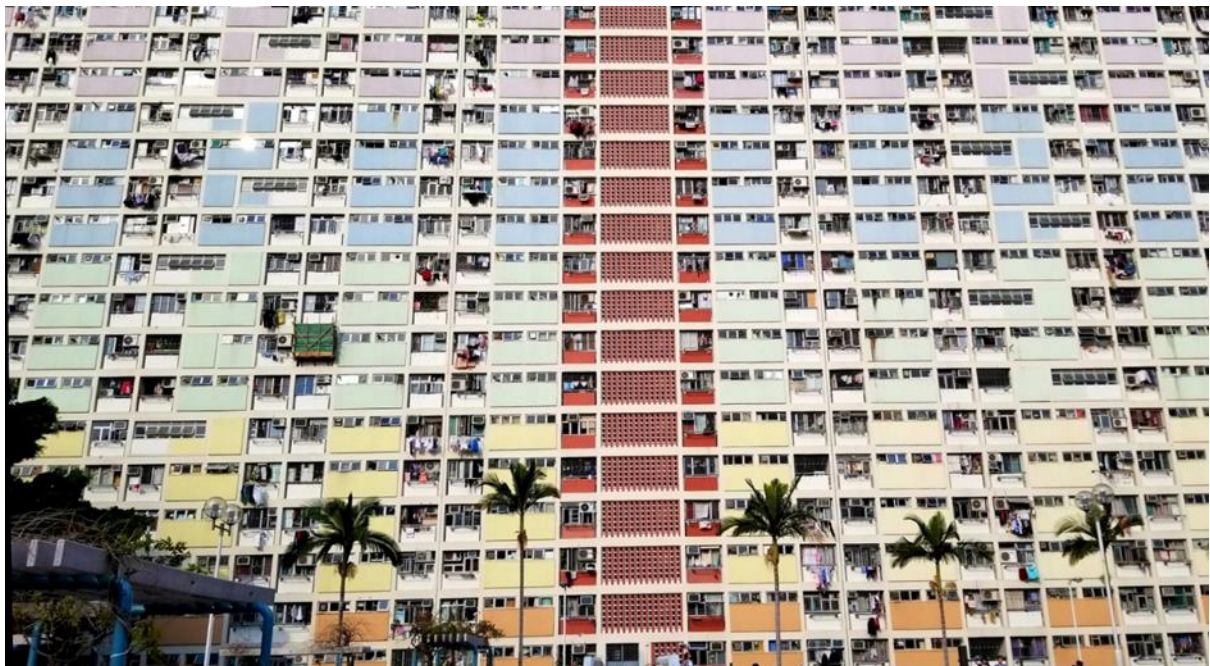
'Rainbow Estate', Hong Kong by Jeffery (UVI)