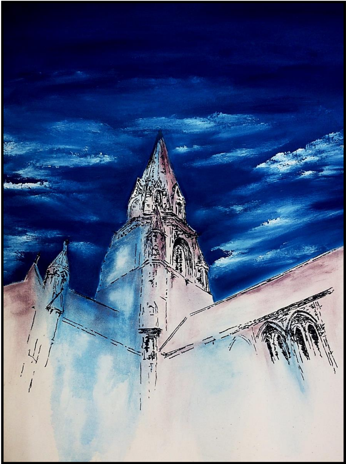
Oil on canvas by Struan (UVI)