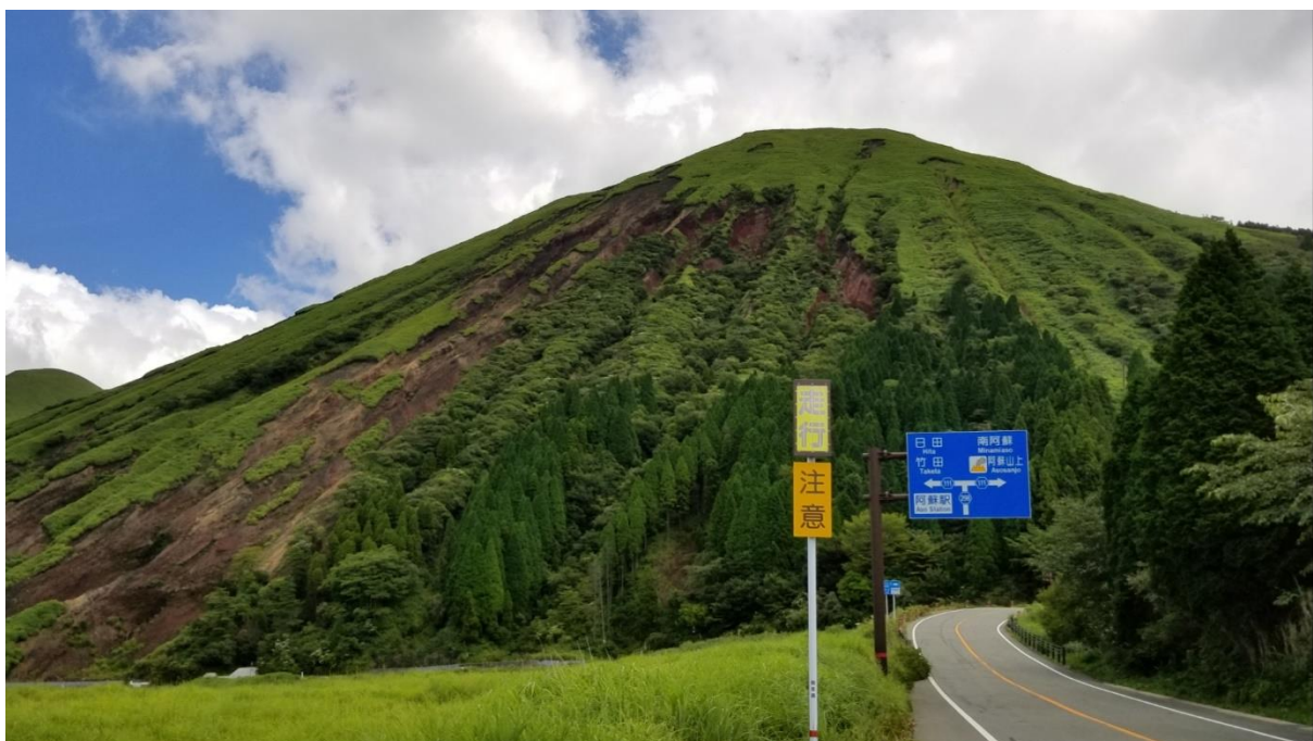
Mount Aso, Japan